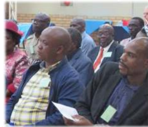
Some of the attendees at the 2022 Church Leaders' Conference