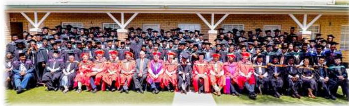
Class of 2022

Despite the challenging economic conditions in our country, Mukhanyo was able to carry out its running operations at a cost of R13.5 million in 2022. While local donations fell short of the hoped-for 50%, international donations provided around 60% of the total income. We are deeply grateful for each of these donations, as they make this ministry possible.