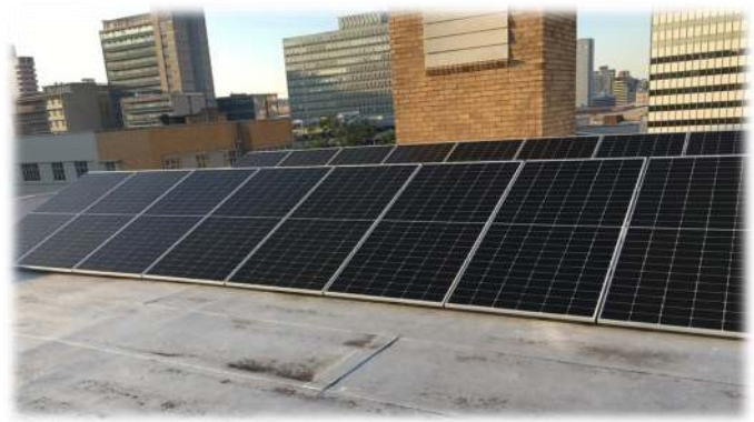
Solar Panels at the Johannesburg Campus

Although the level of crime has been relatively low in KwaMhlanga in recent years, it is currently on the rise.